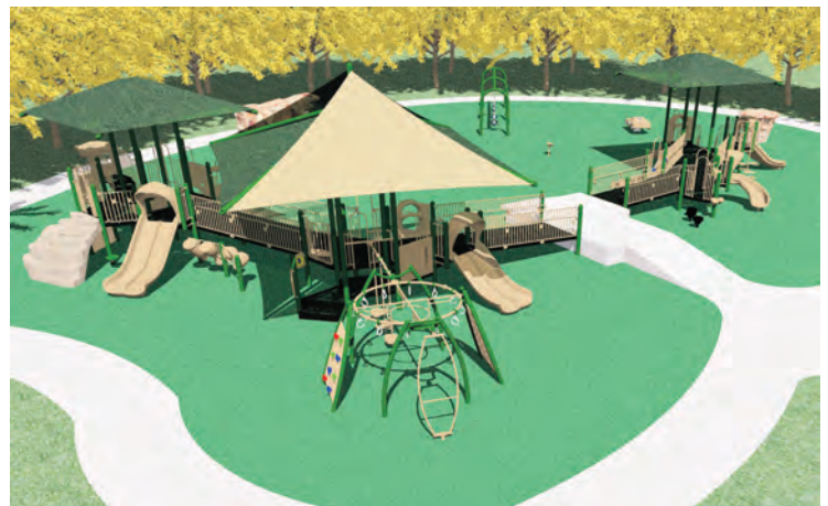
Conceptualized drawing of Coffee Park's barrier-free playground.

The Citizen of the Year Award was initiated in 2005 by the City Council to heighten public awareness and appreciation for the many residents who work, often behind the scenes, to better the City's quality of life. The City acknowledges that while such residents aren't fueled by a desire for civic recognition, their efforts, whether aimed at protecting our local environment, beautifying our neighborhoods, increasing local opportunities for our youth or raising money for various worthy projects, all demonstrate a level of citizenship that helps make University Park such a special place to live.