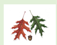
Red Oak "Shumard"